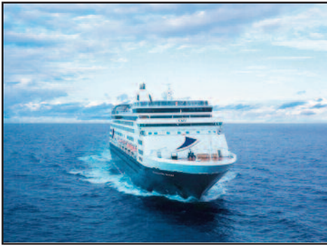
"Vasco da Gama"