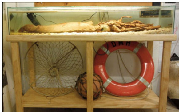
George the Giant Squid

The Wallaroo Heritage and Nautical Museum is open daily from 10am – 4pm. Group bookings are welcome. There are 4 buildings of local historical displays including the Freemasons Wallaroo Branch, the railway and of course the famous George the Giant Squid! Souvenirs and visitor information are also available.