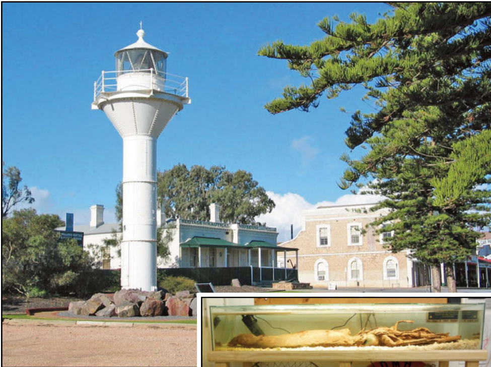
Wallaroo Heritage and Nautical Museum